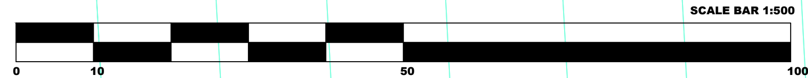
WORKS AREA LAYOUT PLAN SCALE 1:500